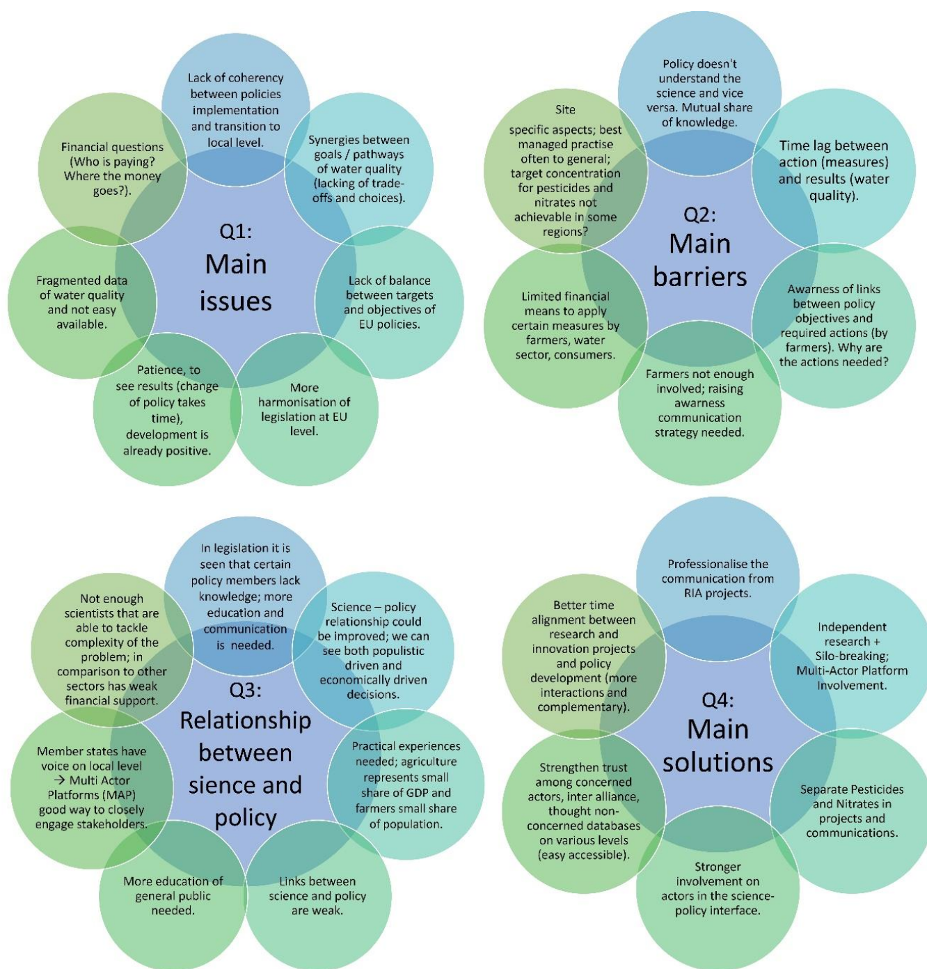
Figure 2: Key points for Questions 1, 2, 3 and 4 on the role of science in EU policy making and implementation related to drinking water resource protection against diffuse pollution of nitrates and pesticides from agriculture in the EU.

The issue of nitrate pollution from overstocking was mentioned in the workshop, such as in regions in Germany, Flanders, the Netherlands, Brittany, and Catalonia. A significant part of the nitrate pollution comes from farms that do not have land and do not fall under the CAP. In these regions and in regions with intensively managed cropping systems, such as vegetables in Andalucía and the Netherlands, there is frequently an overuse of manure and mineral fertilizers leading to nitrate leaching into groundwater and surface water. Very few member states have set out a comprehensive approach to reducing nitrate leaching in order to meet the target goals of the WFD.